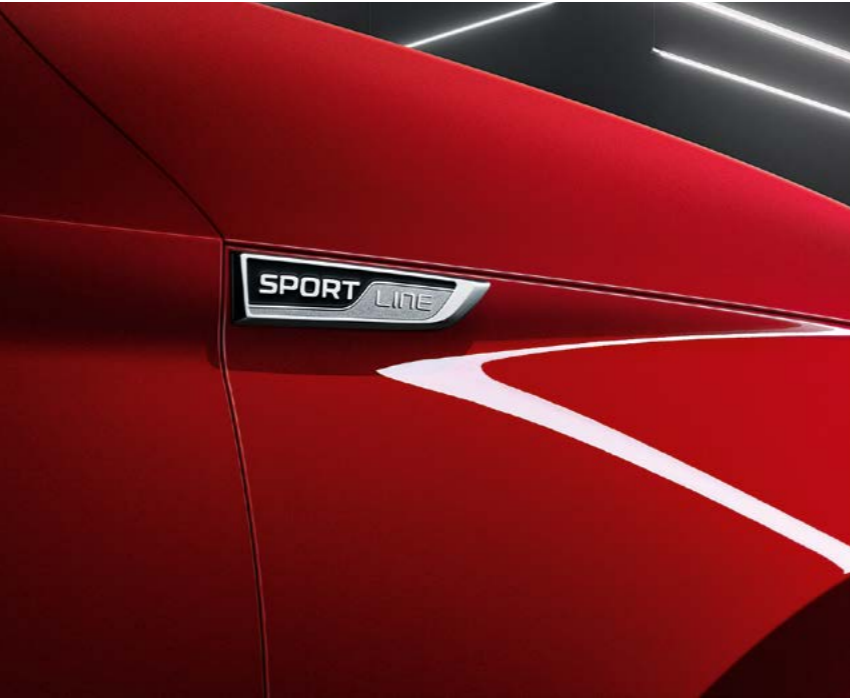
BADGE As proof of the car's sports style there's a badge included on the front wings.

DYNAMIC DESIGN This car can't be overlooked. A glossy black front grille and features to the sides of the air intake in the front bumper are accompanied by darkened fog lamps. The sporty look of your car can be underlined with exclusive 19" Supernova black alloy wheels. The top-end option features full LED Matrix headlights, which offer enhanced road lighting and a higher degree of safety.