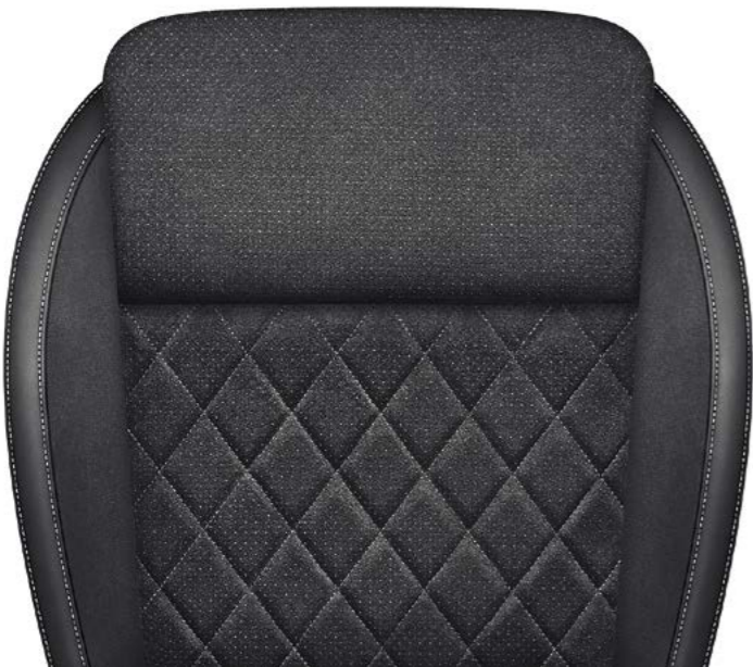
The upholstery in a combination of black Alcantara®/leather/leatherette comes as standard.