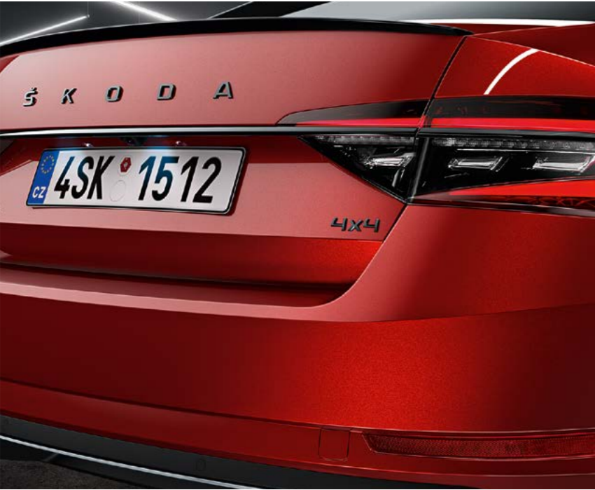
REAR VIEW While the ŠKODA inscription in the back declares the car's roots, the glossy black strip between the full LED rear lights comes exclusively with the SUPERB SPORTLINE. The liftback version also features the glossy black 5th door spoiler.

Elegance can also be daring. Dynamic details in glossy black design give the SUPERB SPORTLINE a vigorous attitude. The sports chassis improves the car's aerodynamics as well as your driving pleasure.