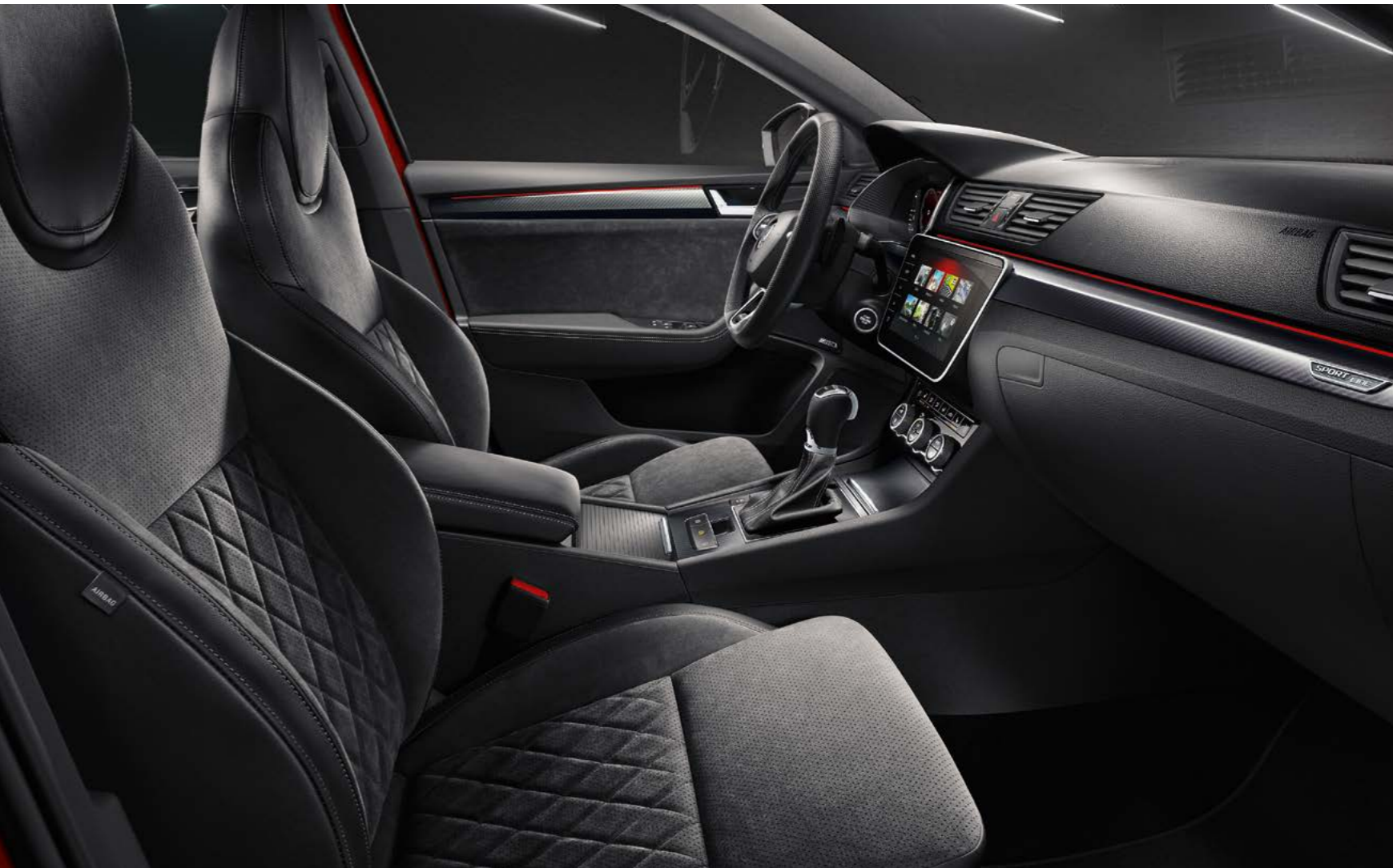
SPORTLINE BLACK INTERIOR Carbon décor Alcantara®/leather/leatherette upholstery, front sports seats and sports steering wheel