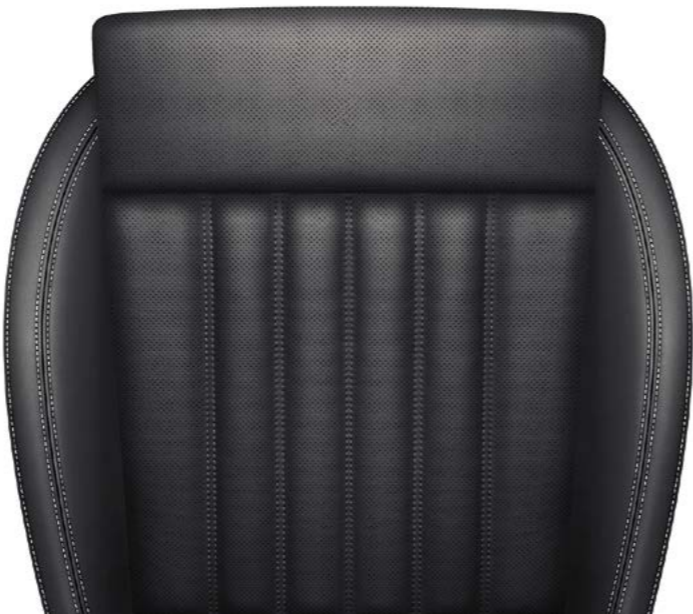
The black perforated leather/leatherette upholstery and ventilated front seats are optional.