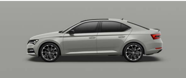
STEEL GREY UNI